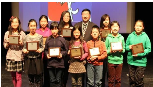
2014魁省法语节作文赛, 英才学生表现优异, 中考班学生几乎囊括少年组所有奖牌